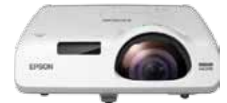
Short Throw Interactive